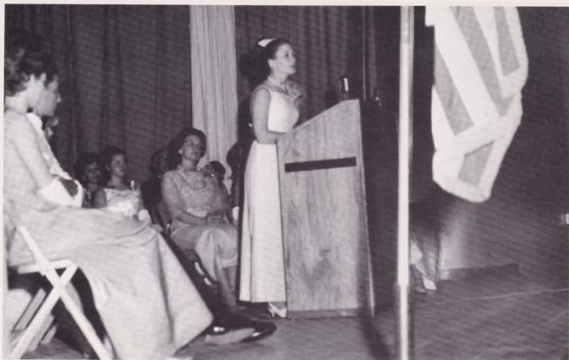
Governor Lauri Speaks To Girls State Citizens