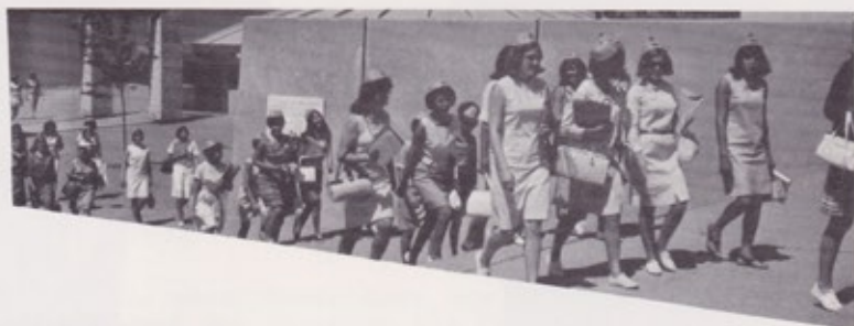
To The Student Union Building and sessions