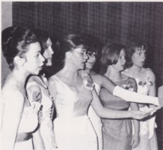
GIRLS STATE CHORUS