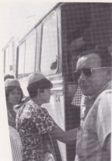
All Aborad for Santa Fe