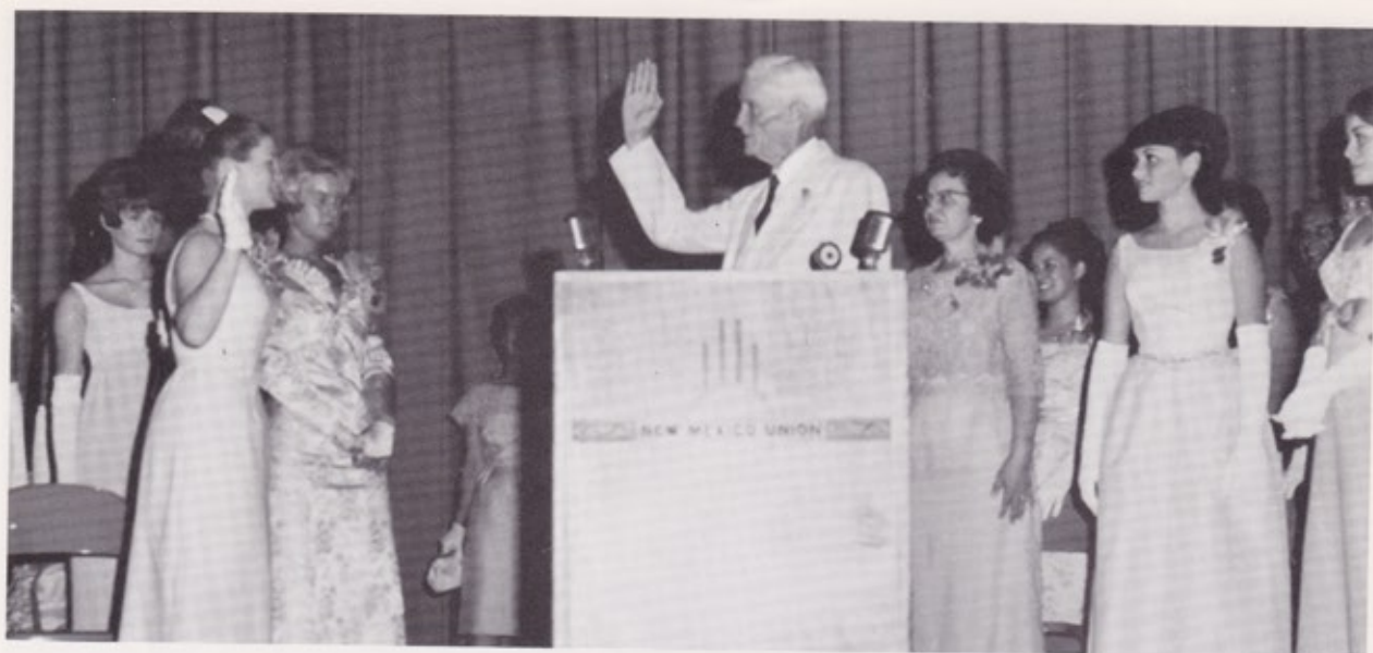
Lauri Gameral Becomes The 1966 Governor