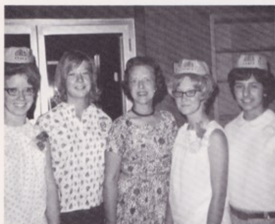
Yearbook Staff and Advisor