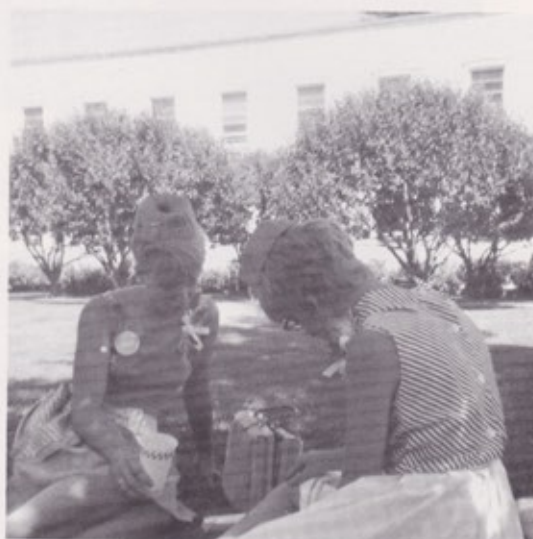
Time out for rest