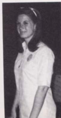
Final address from Governor Lauri