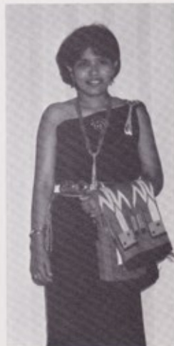
MODELING THEIR OWN CREATIONS