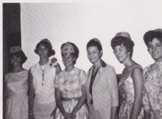
After the Interview