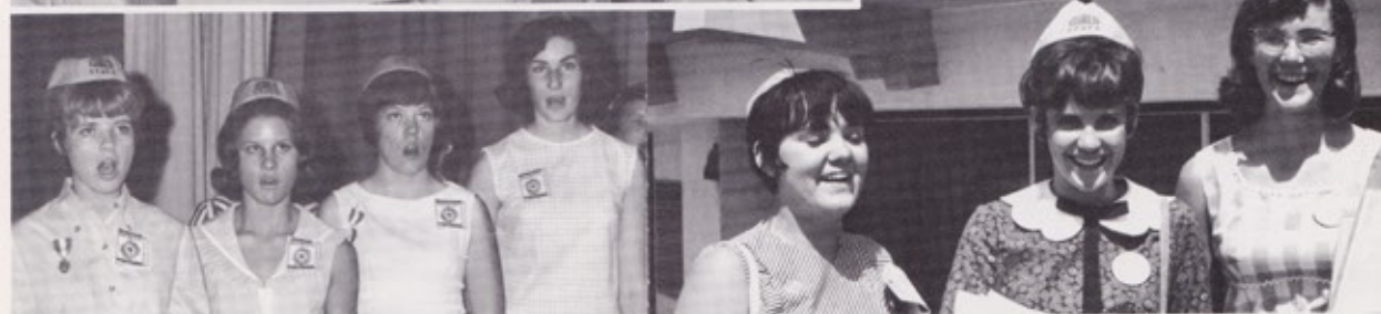
Every Day Life At Girls State