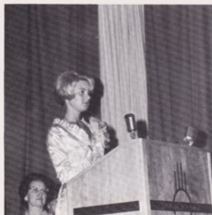
1965 Governor Lisle