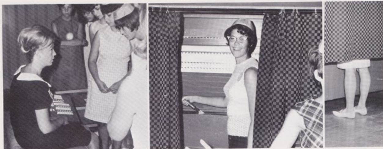
Using The Voting Machine