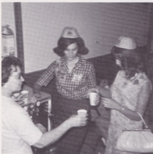
Free cokes at Mabry Hall