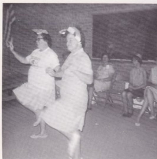
All together now!