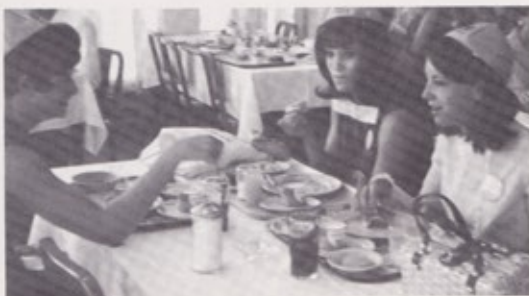
In the Dining Hall