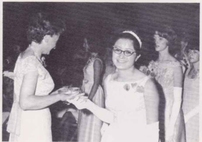
GIRL STATE PINS