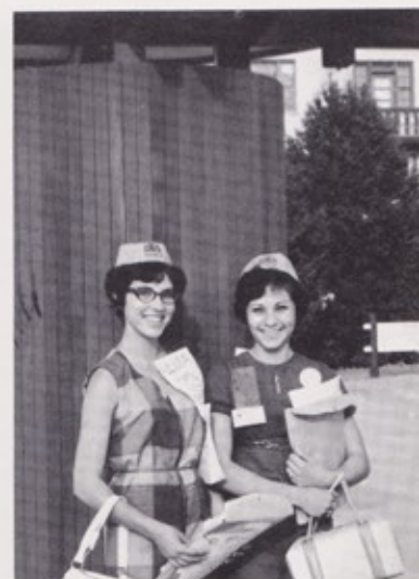
To The Student Union Building And Classes