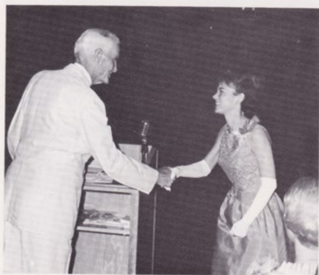
Lt. Governor Debbie