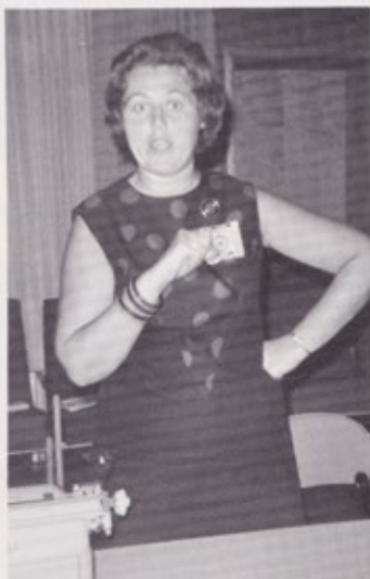
"What" another copy?