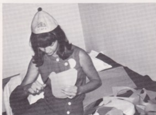
Making a beanie