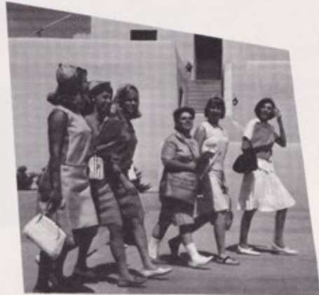
The Long Walk