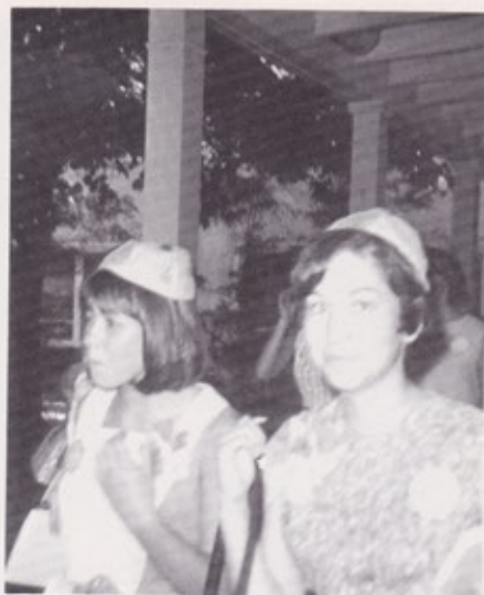
Under the Portal