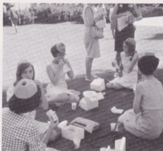
Lunch on the lawn of the State Capitol -- No Littering Here