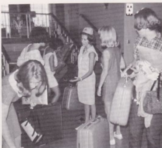
Arriving at Girls State