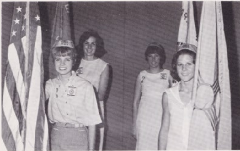
OPENING CEREMONIES JUNIOR COUNSELORS PRESENT COLORS