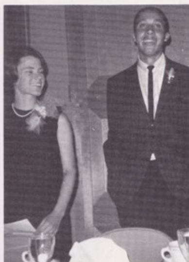
Inauguration Dinner Guests