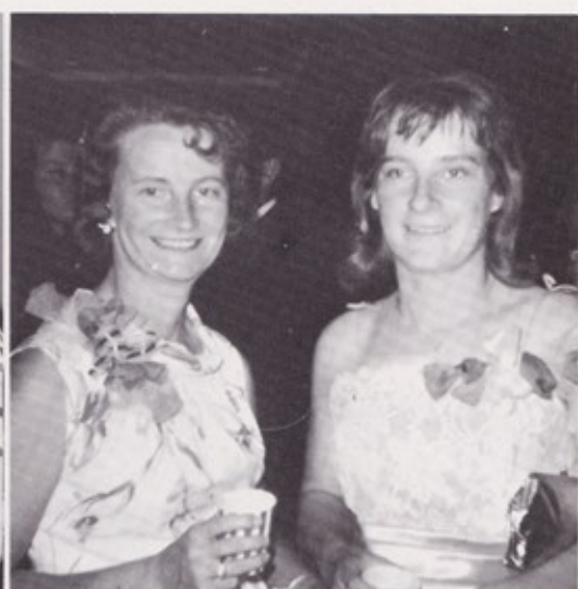
Mother-- Counselor Daughter--Stater