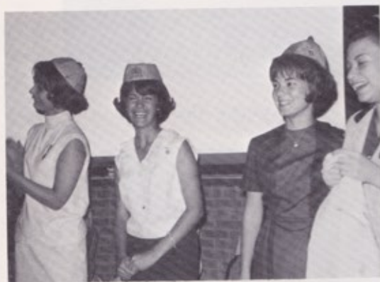
Delegates and Alternates