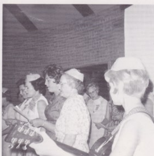
"We ought to know"