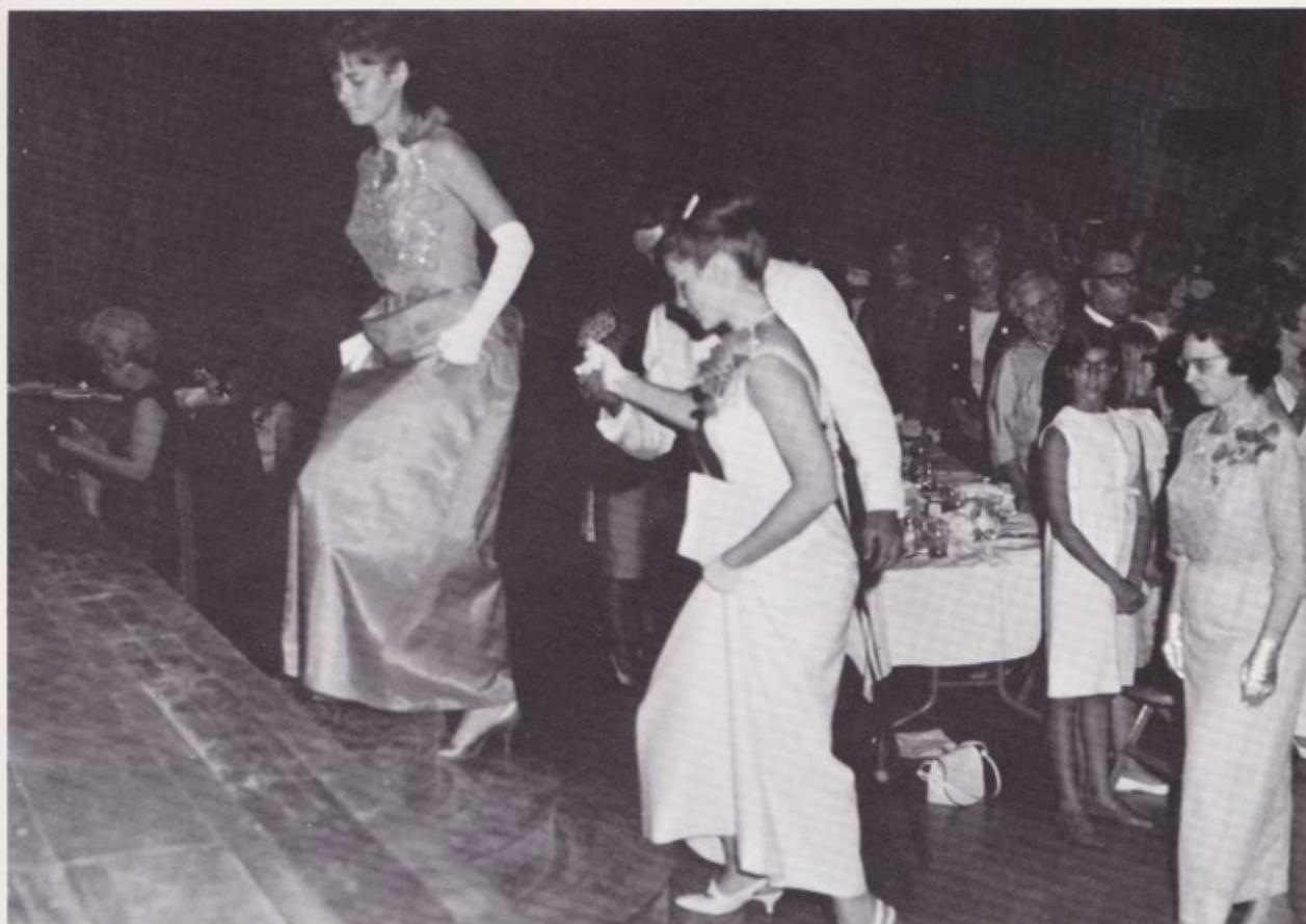
Up The Steps To The Podium