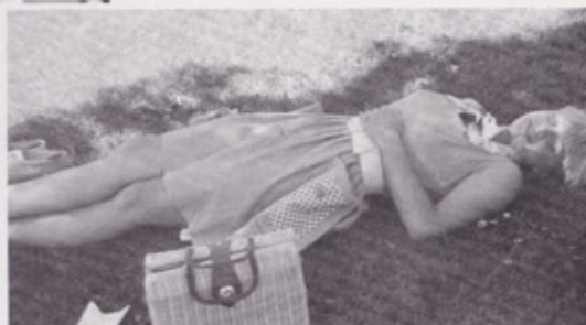
Resting on the Capitol lawn