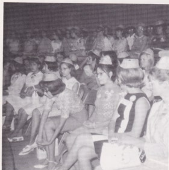
Assembly in Mabry Hall