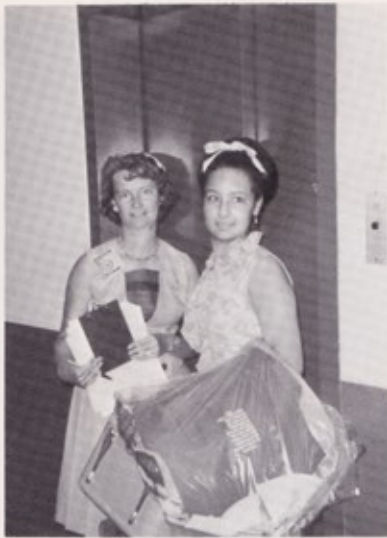
To Our Rooms