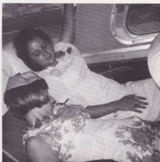
The end of a day in Santa Fe. The bus ride home.