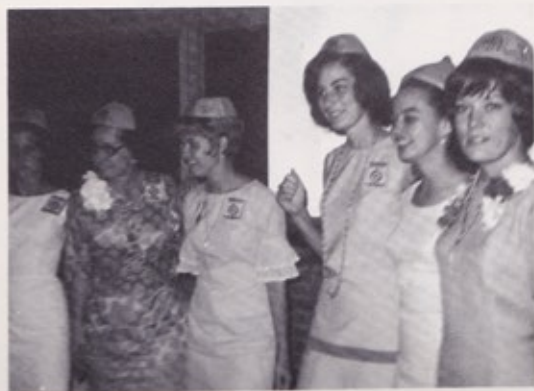
Congratulations to Girls Nation Delegates