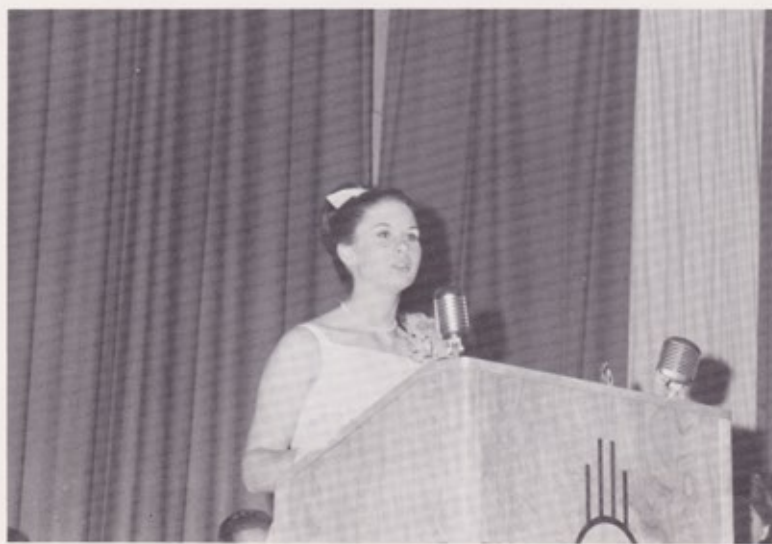
GOVERNOR LAURI DELIVERS A FINAL ADDRESS TO THE SESSIONS