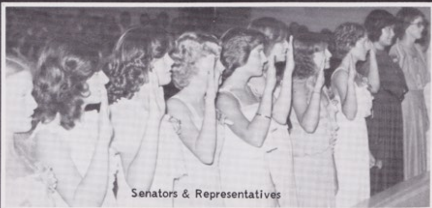
Senators & Representatives