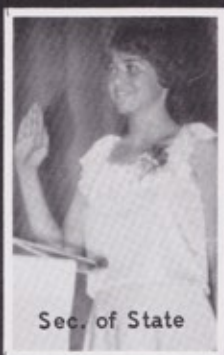
Sec. of State