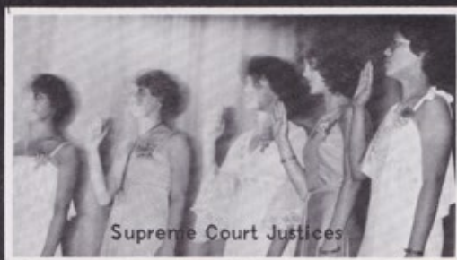
Supreme Court Justices