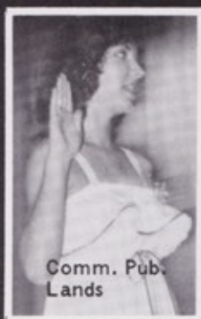
Comm. Pub. Lands